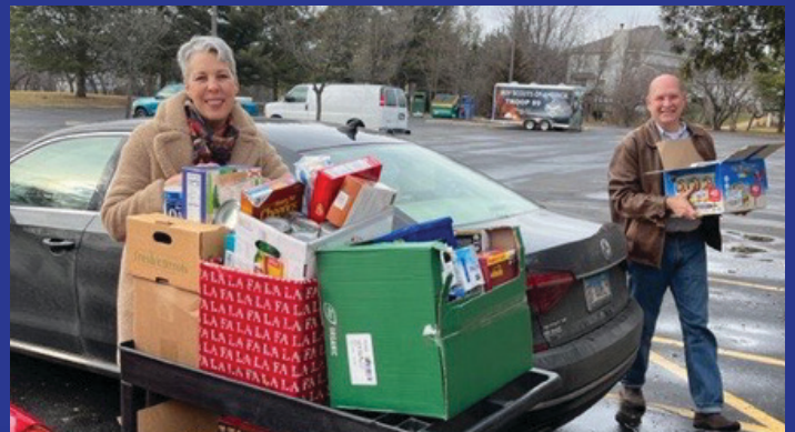
Volunteers from Little Home Church by the Wayside deliver food from the New Year's food drive.