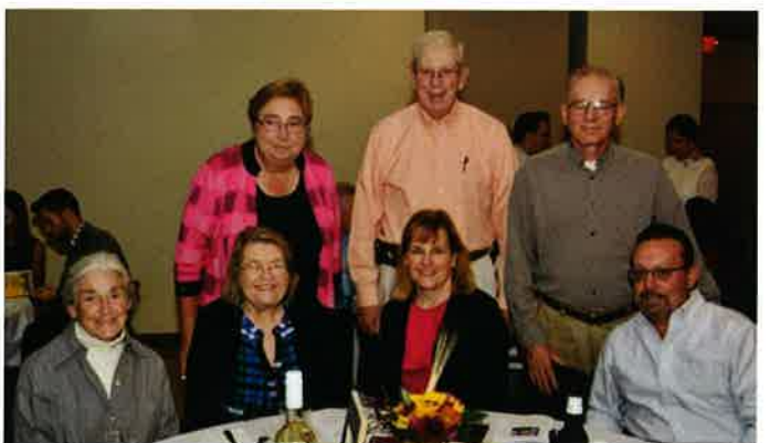
St. Andrew Lutheran Church had a table at our 2017 HarvestFest Dinner Auction.