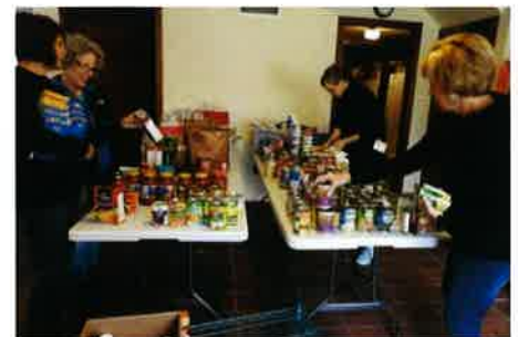
Volunteers at Immanuel Presbyterian sort the donations from a local food drive.

THANK YOU to SchrecDesign for volunteering their services to design our Annual Report! Email SchrecDesign@comcast.net