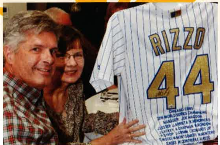
View more event photos at: http://bit.ly/HarvestFest2017Pics . Feel free to tag yourself and to share!"