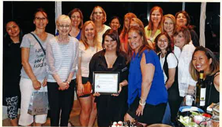
Mario Tricoci Salon in Bloomingdale hosted a Girls's Night Out event, donating spa services to our guests!