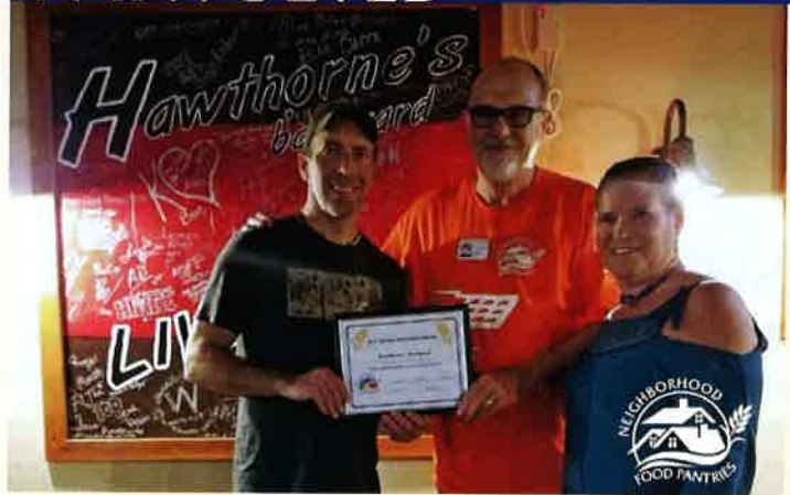
Hawthorne's Backyard in West Chicago held a Give-Back Day in September, donating 15% of the day's receipts!