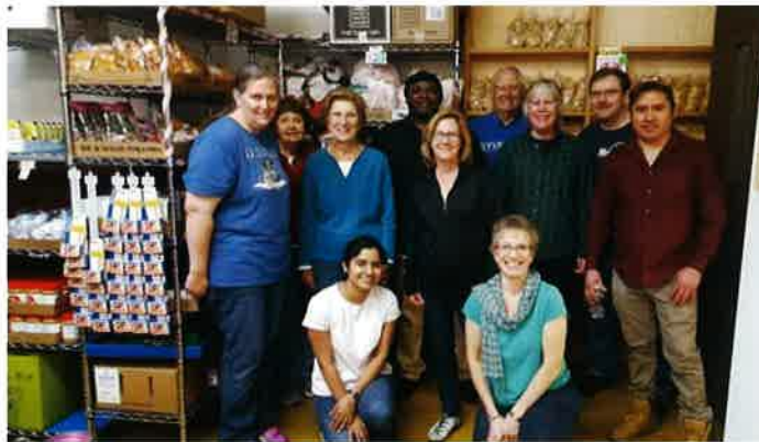
This group of volunteers at Resurrection keeps the pantry running.