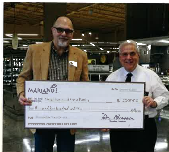
Mariano's made a donation to our pantries as part of their Grand Opening in Bloomingdale.

Royal Die and Stamping Spotlight Theatre Group St. Andrew Lutheran Church St. Athanasios St. Francis High School St. Irene Catholic Community St. Isidore Church St. Michael UCC State Bank West Chicago Thrivent Financial Trinity Lutheran United Methodist Church United Methodist Women Village of Carol Stream West Chicago Library