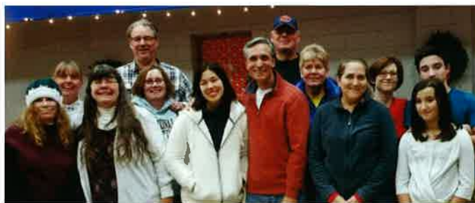
Volunteers at Real Life Church held a toy drive for local families.