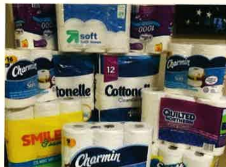
The Roselle Lions Clubs collected paper goods for our pantry at Resurrection.