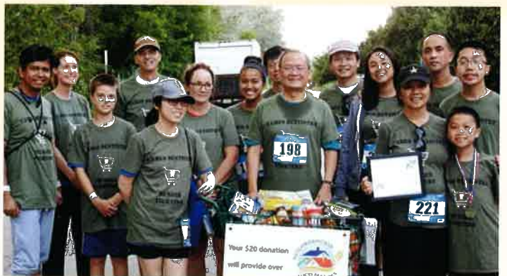
Cameo Dentistry had the largest team at the 2017 Shopping Cart Shuffle 5K.