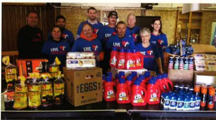
Thrivent Financial organized an Action Team, collecting and purchasing much-needed items for our pantry at Lutheran Church of the Master.