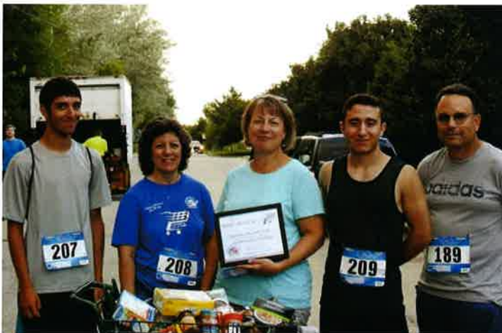
“Resurrection Sole Mates” were the #3 fundraising team at the 2017 Shopping Cart Shuffle 5K.

Our Church Partners support our mission by providing volunteers, financial support and representation on our Board of Directors, volunteer committees or Representative Assembly.