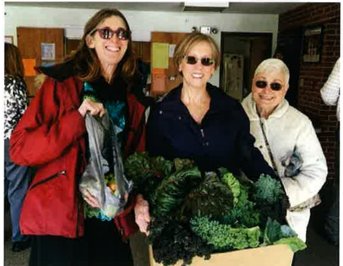
Members of the Heritage Presbyterian Church deliver fresh produce from their Children's Garden to our pantry at Lutheran Church of the Master.