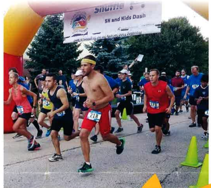
View more event photos at: http://bit.ly/SCS5KCandids , http://bit.ly/SCS5KFinish , and http://bit.ly/SCS5KAwards . Feel free to tag yourself and to share!