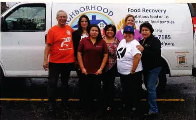
Republic Bank held a food collection drive for our pantry at Real Life Church in West Chicago during their annual SHRED event!