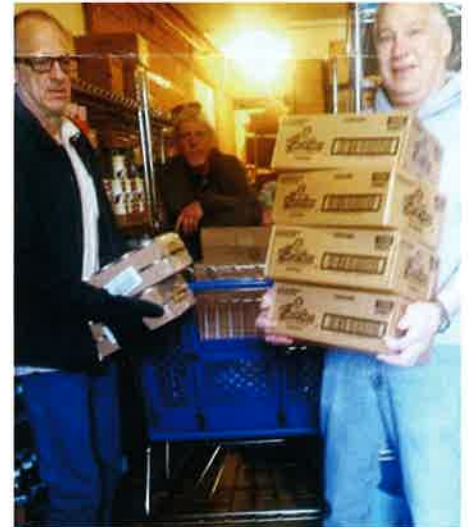
Volunteers at Lutheran Church of the Master unload the truck from the Northern IL Food Bank.