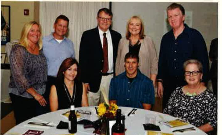
Carol Stream Rotary Table at our 2017 HarvestFest Dinner Dance.