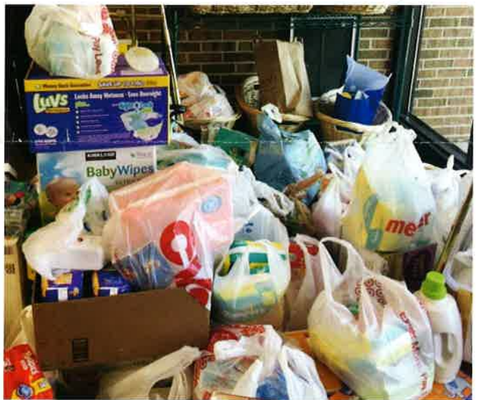
St. Isidore Catholic Church held a Lenten Collection, asking parishioners to bring in a different item for our pantries each week during Lent to support our pantries.