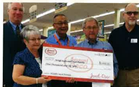
Jewel made a donation to our pantries as part of their store reopening event.