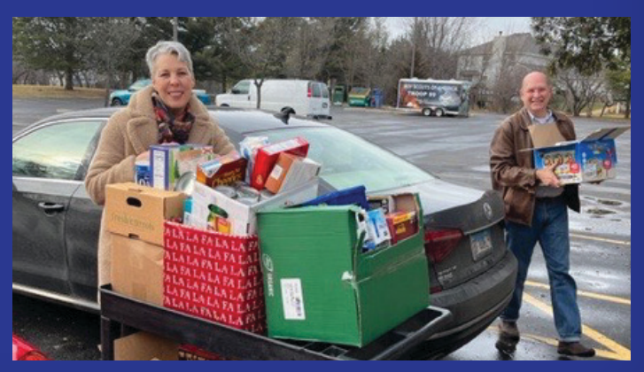
Volunteers from Little Home Church by the Wayside deliver food from the New Year's food drive.